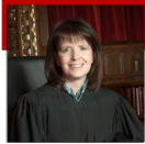
JUDI FRENCH FOR OHIO SUPREME COURT JUSTICE